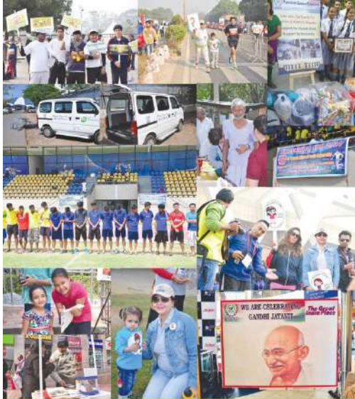
Parivartan Sandesh Foundation Team During Various Social Activities